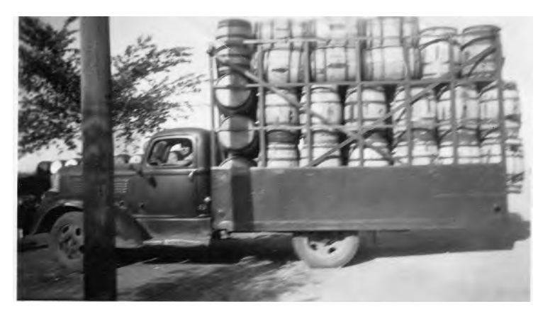
Jacob Kitzinger Sr.'s truck loaded with barrels