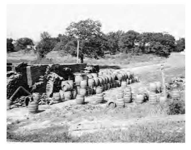
Backyard of Waterford Ave. property 1936