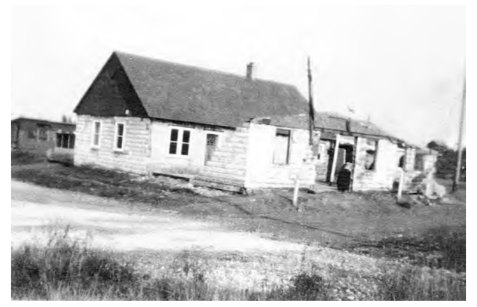
The Kitzinger family home that still stands on Waterford Avenue

Photo shows part of the building being removed to make room for the new road.